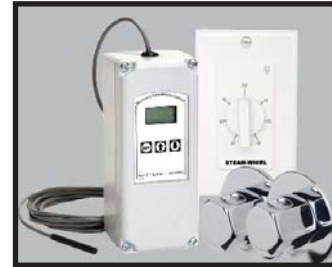
Light Use Gemini Accessory Kit

ACCESSORY KIT OPTION(S): finish options listed on reverse