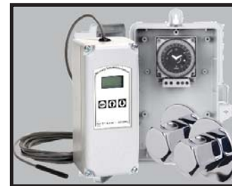
Heavy Use Gemini Accessory Kit